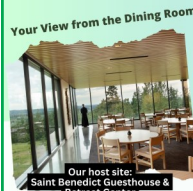
Your View from the Dining Room