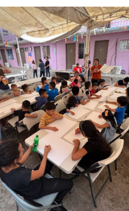
Young adults from Maryknoll's YAE community with migrant children